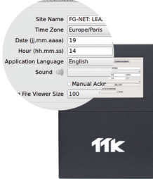
User-friendly interface of configuration