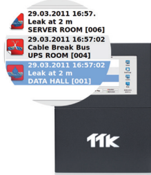
Simultaneous alarms displayed on one screen