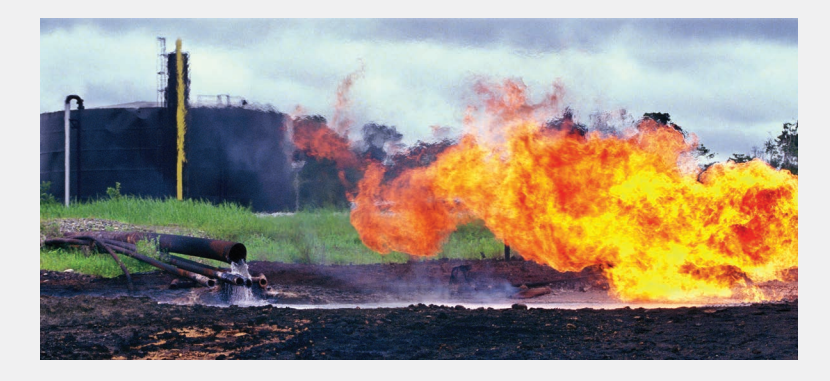
Oil contamination to water and land