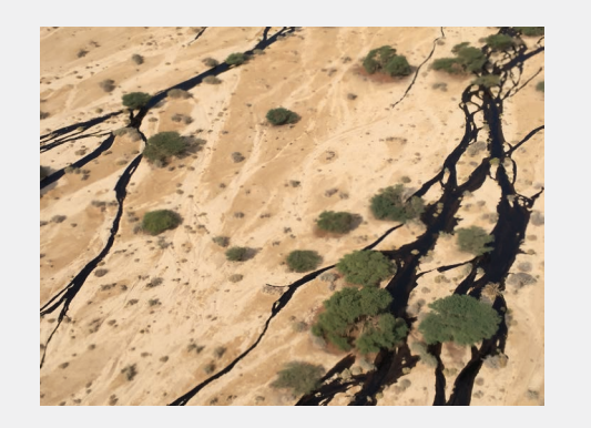
Oil spill at Evrona Nature Reserve

TTK hydrocarbon leak detection system in the Oil & Gas industry is specially designed to be installed in different environments, such as tank farms, pipelines, airports and refineries. The system is capable of detecting gasoline, fuel, crude oil, and jet fuel amongst others. Early detection with accurate location of oil leaks provided by the system allows reacting at a very early stage thus preventing environmental damage.