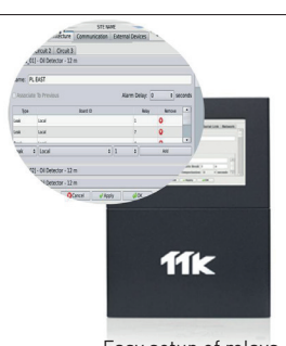
Easy setup of relays for each cable