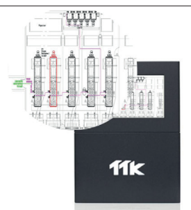
Dynamic map shows leak in real time