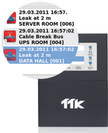
Simultaneous alarms displayed on one screen