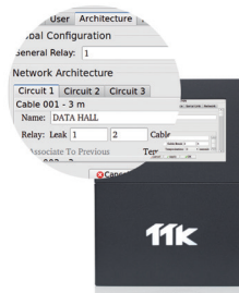
Easy setup of relays for each cable