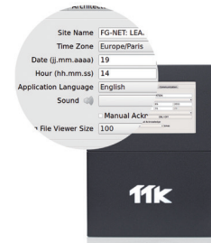
User-friendly interface of configuration