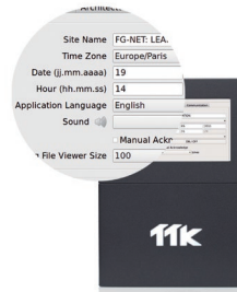
User-friendly interface of configuration