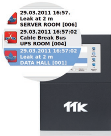
Simultaneous alarms displayed on one screen