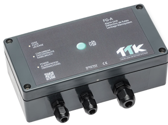
FG-A Wall Mounted Unit