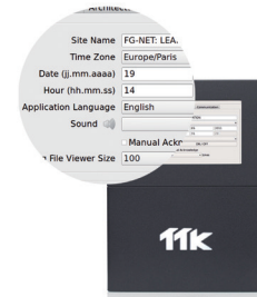
User-friendly interface of configuration