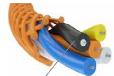
The heart of the technology: Silicone jacket element containing carbon black particles. It swells quickly by absorbing liquid hydrocarbon.

TTK hydrocarbon leak detection systems consist of FG-OD range sense cables, point sensors and FG-NET-LL range digital monitoring units.