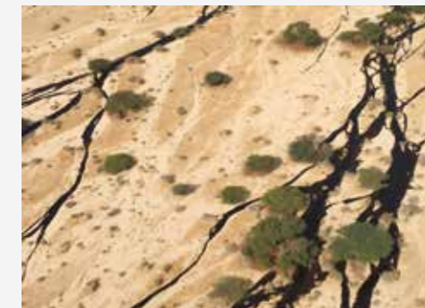
Oil spill at Evrona Nature Reserve

TTK hydrocarbon leak detection system in the Oil & Gas industry is specially designed to be installed in different environments, such as tank farms, pipelines, airports and refineries. The system is capable of detecting gasoline, fuel, crude oil, and jet fuel amongst others. Early detection with accurate location of oil leaks provided by the system allows reacting at a very early stage thus preventing environmental damage.