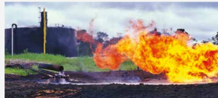
Oil contamination to water and land