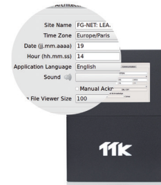
User-friendly interface of configuration