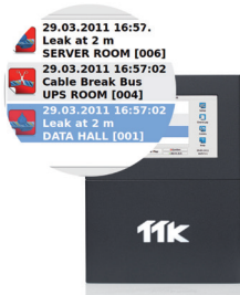
Simultaneous alarms displayed on one screen